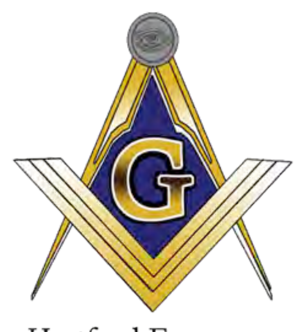
Hartford Evergreen Masonic Lodge #88